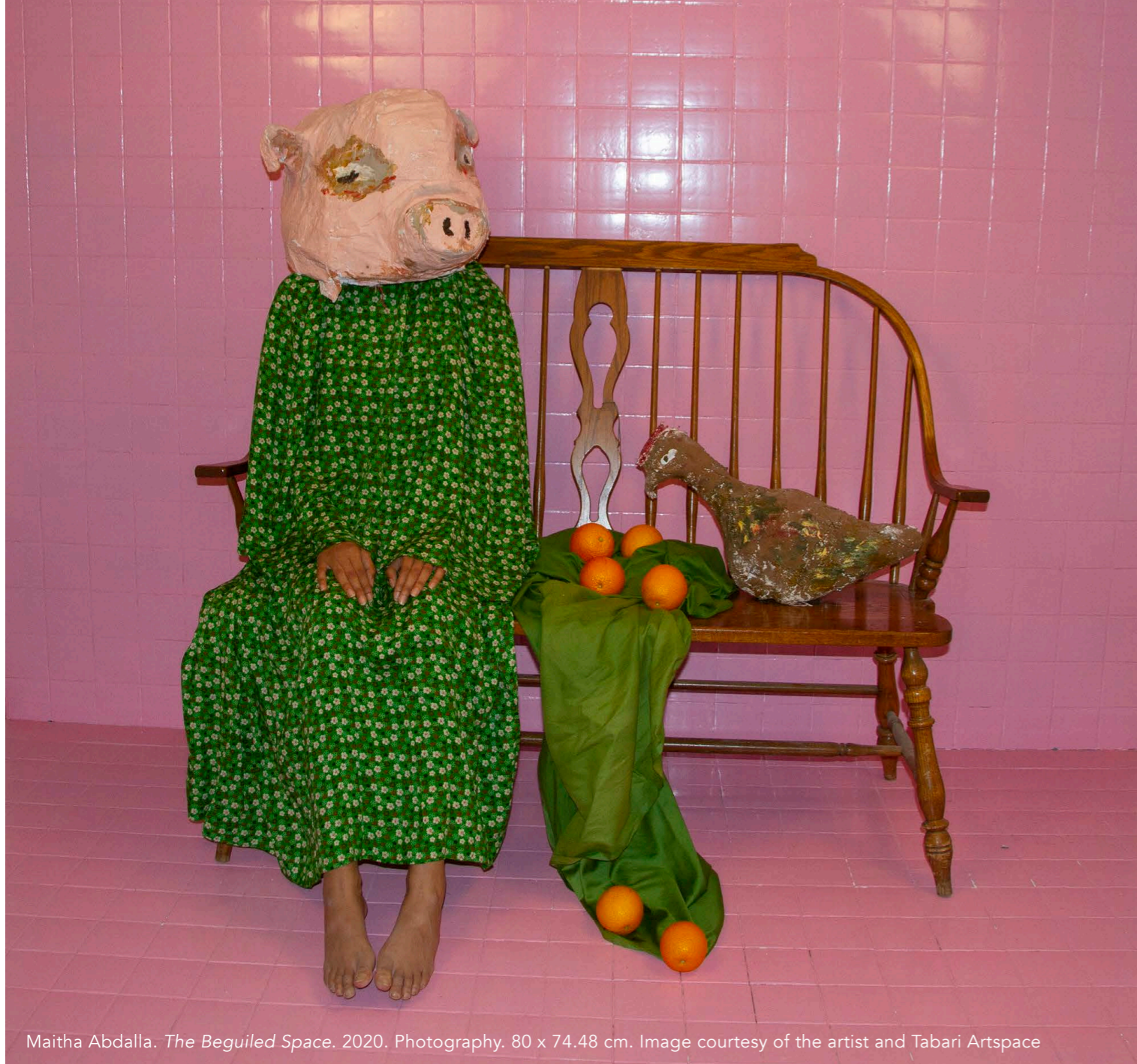
Maitha Abdalla. The Beguiled Space . 2020. Photography. 80 x 74.48 cm.

these characters into my work. At that age, I was introduced to art films, and it changed the way I saw things and described my stories. I would watch a film and fall in love with it, then I would go back home and research the script, reading the details of how the characters were being developed," she explains.